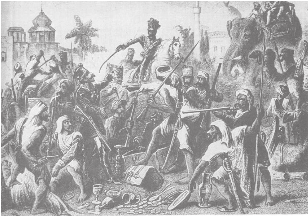
An illustration entitled 'Mutinous Sepoys Dividing Spoils' from 'The History of the Indian Mutiny', published in Britain in 1860. 'Spoils' means the items stolen during the fighting.